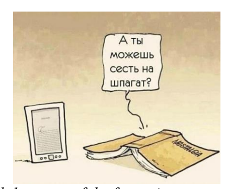
Figure 2 – Internet memes for Task 1 as part of the formative stage of the pedagogical experiment

Table 2 – Criteria and descriptors for Task 1 as part of the formative stage of the pedagogical experiment