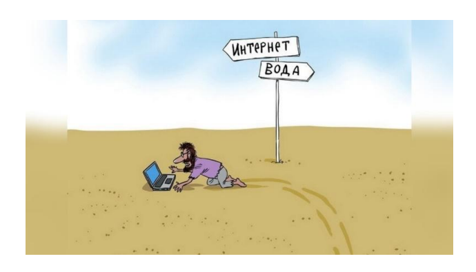
Figure 3 – Internet memes for Task 2 as part of the formative stage of the pedagogical experiment

Task 2: Consider an Internet meme (Fig.3) and formulate the topic and purpose of the lesson. The criteria and descriptors for Task 2 are presented in Table 3.