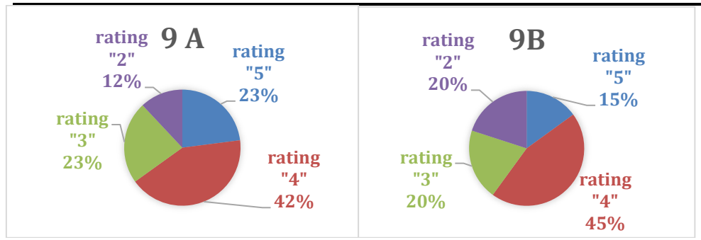
Figure 5 – The results of repeated knowledge control conducted at the stage of the control experiment in the control (9A) and experimental (9B) groups

Based on the results of the comparative analysis, it follows that in the experimental group there is a significant increase in the quality of knowledge, a linear movement between levels in a positive direction, which allows us to judge the success of the pedagogical experiment.