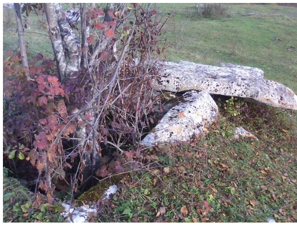
a) the collapse of dolmen No. 74